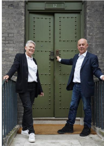
Langlands & Bell, 2019