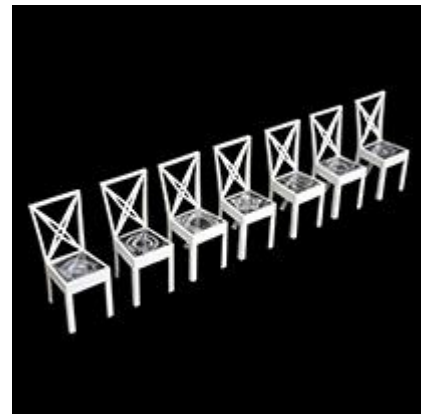
Artist's Maquette for Grand Tour , 2020

Contemporary society's relationship with architecture is to be explored in a major solo exhibition by the artists Ben Langlands and Nikki Bell, opening at Sir John Soane's Museum in March 2020.